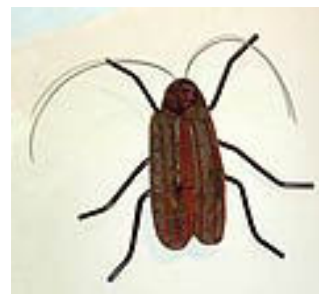
[Artist Mark Dimock's Site www.bumpkin.co.nz ]

Eyes Spy is a new 'treasure hunt' style event for children, families, and visitors to our city, in the form of a walk/animal hunt in the Native Bush area of the Christchurch Botanic Gardens. Eye-direction signs, at child-friendly height, will reveal hidden birds and insects along the way. These clues will encourage children to look around bushes, up trees and on the ground in their quest to unearth hidden creatures. Live storytelling of New Zealand stories by Garden Club members will guarantee a popular and educational diversion for all diminutive 'animal hunters.'